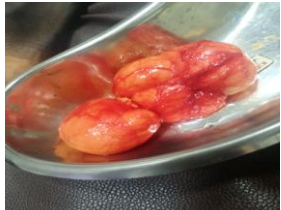
Figure IVb showing multiple lobulated, well encapsulated mass.