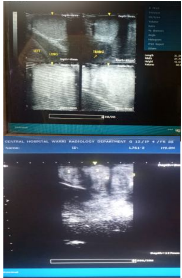
Figure II. Ultrasound scan of the scrotum showing homogenous isoechoic masses in the scrotal sac.