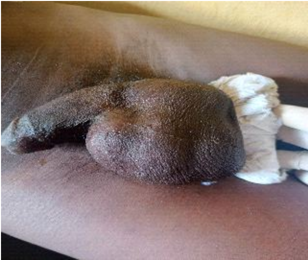
Figure I showing four scrotal masses (I,ii,iii,iv).